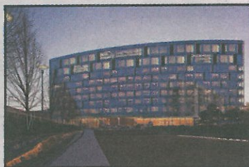
The Katz Women's Hospital Post Partum Unit at North Shore University Hospital - Manhasset, NY

This project was designed from day one with the intent of certification. The